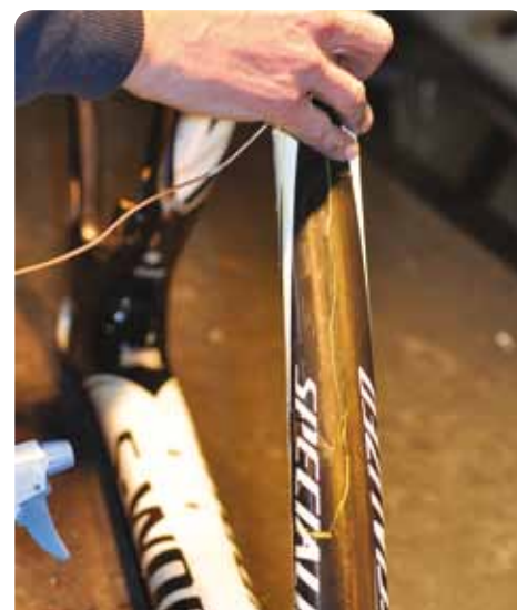
This road frame had obvious top tube damage from a handlebar impact. In this case, Raoul found delamination way back at the seat tube junction—it's unlikely that this would have been detected without ultrasound.