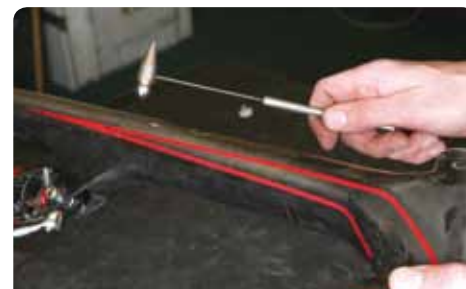
Acoustic testing can detect internal delamination, but only where the damage affects a reasonably large area. By comparison, ultrasound can reveal the tiniest discrepancy.

▶▶ Warranty and insurance. Ask whether the repairer offers a guarantee on their work—Stan from Bike Addiction offers a five-year warranty on his repairs. Reputable repairers will have liability cover. Glen Oldfield pays thousands of dollars a year for liability cover, just in case a repaired bike goes wrong. Shonky backyard repairers won't have liability insurance.